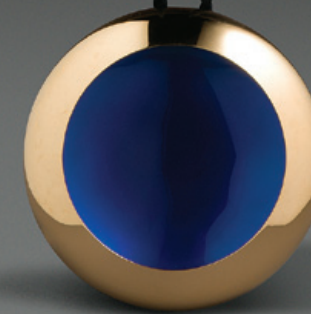
Anish Kapoor (1954-), one of the most influential sculptors of his generation, creates work that ranges vastly in scale, from huge to small pieces of jewelry, such as Water pendant, Form I, Large, designed in 2013 and produced in 22-karat gold and cold enamel in an edition of five plus two artist's proofs. Diameter 2 7/8 inches

Prices for examples by other artists, such as Picasso, Man Ray, Ernst, Fontana, and Lalanne, are likewise steadily rising. Still, while "Artists Jewels" now have their own section in design auctions and contemporary art or