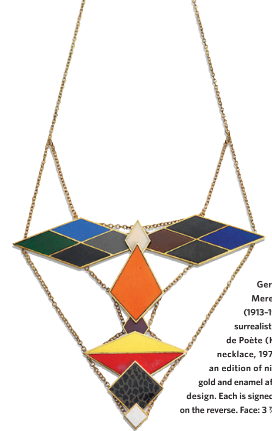
German-born Meret Oppenheim (1913-1985) was a surrealist artist whose Tête de Poète (Head of the Poet) necklace, 1977, was made in an edition of nine in 18-karat gold and enamel after her 1967 design. Each is signed and numbered on the reverse. Face: 3 7/8 by 3 3/8 inches.

jewelry sales, the price tags for these works in precious metals by the harbingers of modernism are but a fraction of those attached to their canvases or bronzes.