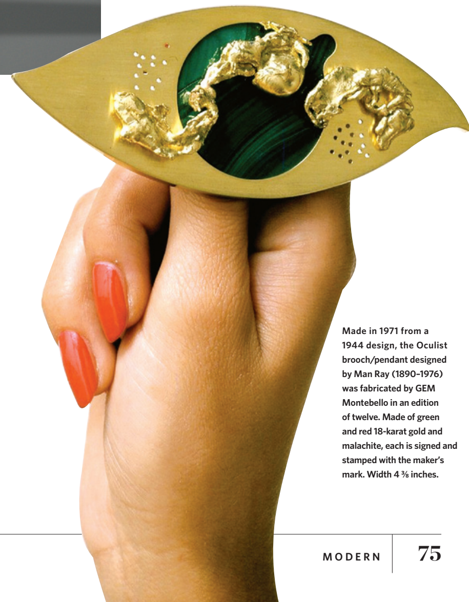
Made in 1971 from a 1944 design, the Oculist brooch/pendant designed by Man Ray (1890-1976) was fabricated by GEM Montebello in an edition of twelve. Made of green and red 18-karat gold and malachite, each is signed and stamped with the maker's mark. Width 4 3/8 inches.

Over the course of the twentieth century, the hierarchy that placed "decorative arts"