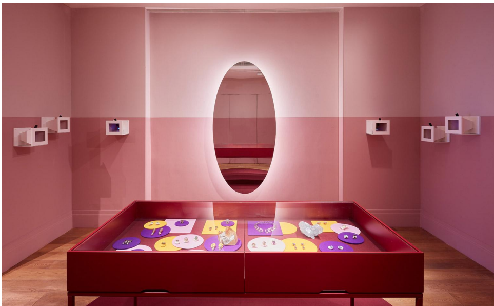
Installation view of Cora Sheibani's 'Glow' exhibition at Louisa Guinness Gallery

‘ T here’s this perception in the West that if a diamond is fluorescent it is less pure,’ jeweller Cora Sheibani explains of the opinion that fluorescent elements in a colourless stone can cloud its purity and lessen its value. ‘I think it’s a shame. Fluorescence should be celebrated rather than looked down upon.’ She has been searching for truly fluorescent gems for the past year. It’s not an easy endeavour. Many minerals phosphoresce, but few are actually fluorescent (their colour change can be admired under UV light only).