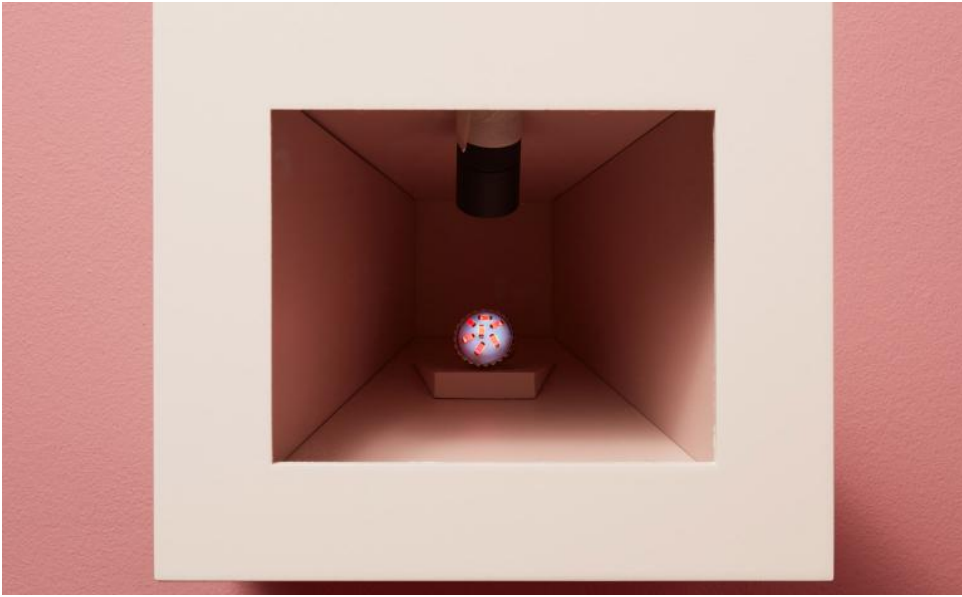
Large Pink Cupcake Ring, 18-ct gold with pink opal and spinels