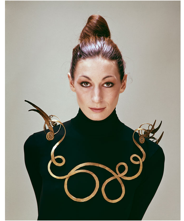
Photo: Evelyn Hofer, Courtesy of Evelyn Hofer Estate. © 2017 Calder Foundation, New York/DACS London