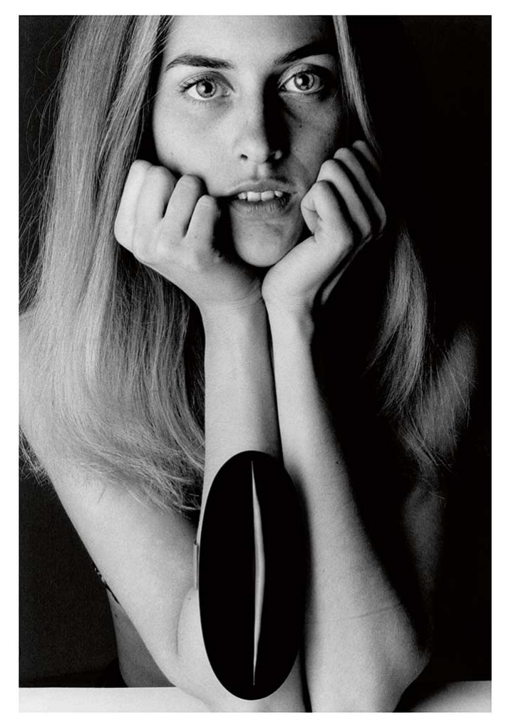
Photo: Ugo Mulas, Courtesy of Ugo Mulas Archive. © Ugo Mulas Heirs. All rights reserved, © Lucio Fontana/SIAE/DACS, London 2017